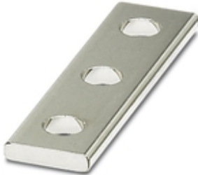
Connection element, length: 64 mm, width: 20 mm, height: 4 mm, number of positions: 3, color: silver

Please be informed that the data shown in this PDF Document is generated from our Online Catalog. Please find the complete data in the user's documentation. Our General Terms of Use for Downloads are valid ( http://phoenixcontact.com/download )